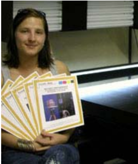
FLAAR staff with the covers of some of the 51 reports on wide format inkjet printing.

FLAAR has hundreds of pages on its digital photography and printer Web sites already.