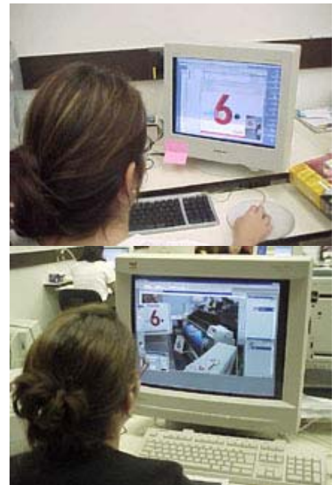
Both platforms PC and Mac are used at each FLAAR facility. Here, working with PosterJet RIP for large format printers

One of the textbooks appears to have a mini-version of Adobe Photoshop included in the CD that comes with the book. If this has enough functions, it would allow you at least to get started.