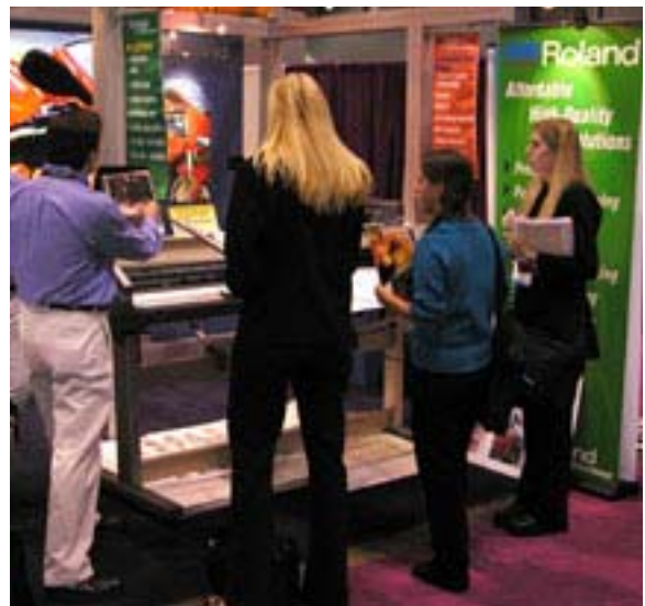
FLAAR editors inspecting the Roland printer at Print' 01

The tradeshow visit personally with Dr Hellmuth and his staff is an additional $300 fee. However you are not required to add the tradeshow sessions to the course. Obviously this $300 does not cover airfare, hotel, meals, nor hotel booking services. Tradeshow entrance is on your own as well; in many cases you can wrangle free tickets from magazines or vendors.