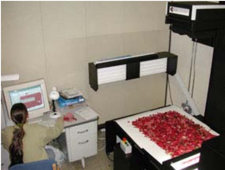
FLAAR staff at BGSU using the recently arrived Cruse digital camera, the only $97,000 digital camera in Ohio that we know of.

If you wish to come to BGSU and learn to use the Cruse digital reprographic camera – scanner (all $ 97,000 worth of it), there is an instruction fee of $100 to cover four hours: one hour of instruction plus three hours of you getting to use the scanner on your own to scan whatever you wish to bring with you (within reason). If you wish to remain the entire day and keep on scanning and/or learning about the adjacent printers, cost is $200 for the entire day (8 am to 5 pm allowing a one hour lunch break). As comparison, a single scan from a camera of this quality is between $ 180 to $ 200 if you went to a commercial prepress, photo studio, or other lab (if you could even find equipment of this nature).