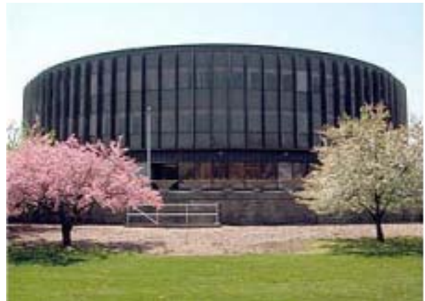
New headquarters for the FLAAR digital imaging facilities at Bowling Green State University.