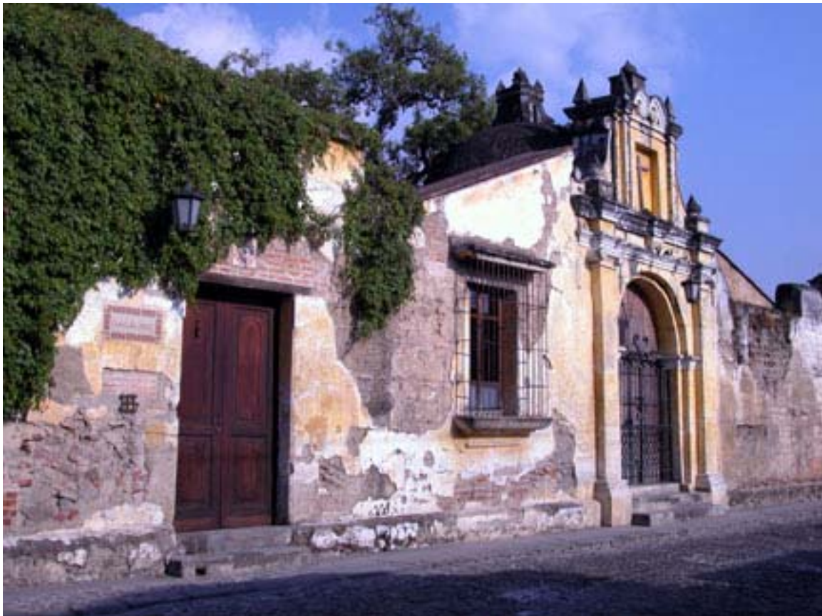
Example of quality you can achieve with a 5 megapixel camera. Photo by Nicholas Hellmuth in Guatemala.

Appropriate for Intermediate through Advanced