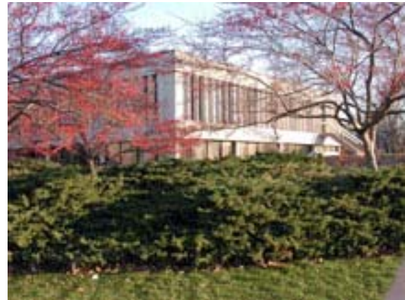
Left: La Merced church in Antigua Guatemala. Right: Bowling Green State University campus