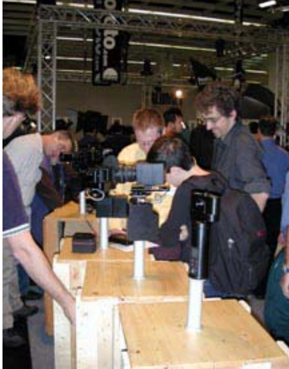
Photokina largest photographic tradeshow in the world.